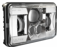
Part Number 0551371 12-24V DOT/ECE LED RHT Low Beam Headlight with Chrome Bezel