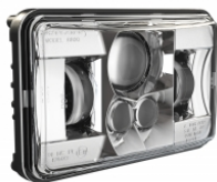
Part Number 0551391 12-24V ECE LED LHT Low Beam Headlight with Chrome Bezel