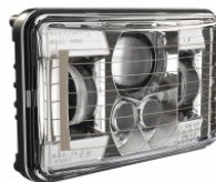
Part Number 0551771 12-24V DOT/ECE LED RHT Low Beam Heated Headlight with Chrome Bezel