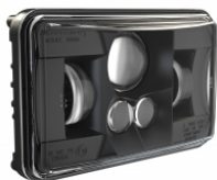
Part Number 0552561 12-24V ECE LED LHT Low Beam Headlight with Black Bezel