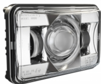
Part Number 0551381 12-24V DOT/ECE LED High Beam Headlight with Chrome Bezel