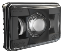
Part Number 0552571 12-24V DOT/ECE LED High Beam Headlight with Black Bezel