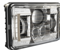
Part Number 0552091 12-24V ECE LED LHT Low Beam Heated Headlight with Chrome Bezel