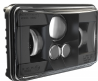
Part Number 0552551 12-24V DOT/ECE LED RHT Low Beam Headlight with Black Bezel