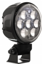
Part Number 0549841 12-24V LED Work Light with Trapezoid Pattern