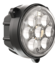
Part Number 0555341 12-24V LED Work Light with Spot Pattern & Panel Mount