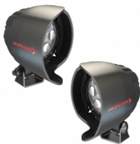
Part Number 0551753 12-24V LED Work Light with Spot Pattern & Side View Mirror Mount - 2 Light Kit