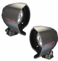
Part Number 0551753 12-24V LED Work Light with Spot Pattern & Side View Mirror Mount - 2 Light Kit