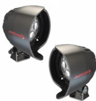
Part Number 0551753 12-24V LED Work Light with Spot Pattern & Side View Mirror Mount - 2 Light Kit