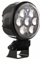
Part Number 0549841 12-24V LED Work Light with Trapezoid Pattern