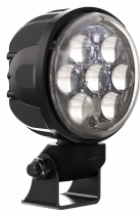
Part Number 0549841 12-24V LED Work Light with Trapezoid Pattern