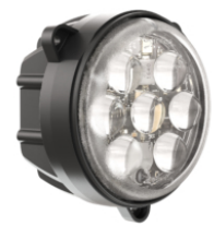
Part Number 0555461 12-24V LED Work Light with Flood Pattern & Panel Mount