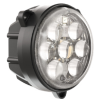
Part Number 0555461 12-24V LED Work Light with Flood Pattern & Panel Mount