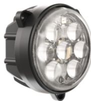
Part Number 0555341 12-24V LED Work Light with Spot Pattern & Panel Mount