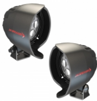
Part Number 0551753 12-24V LED Work Light with Spot Pattern & Side View Mirror Mount - 2 Light Kit