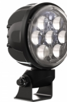
Part Number 0555411 12-24V LED Work Light with Flood Pattern & Harness