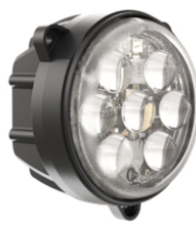
Part Number 0555341 12-24V LED Work Light with Spot Pattern & Panel Mount