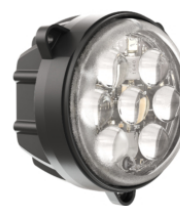
Part Number 0555461 12-24V LED Work Light with Flood Pattern & Panel Mount