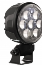
Part Number 0555411 12-24V LED Work Light with Flood Pattern & Harness