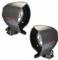
Part Number 0551753 12-24V LED Work Light with Spot Pattern & Side View Mirror Mount - 2 Light Kit