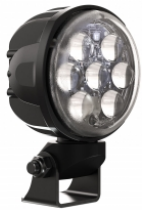
Part Number 0549841 12-24V LED Work Light with Trapezoid Pattern