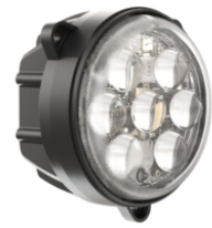
Part Number 0555461

12-24V LED Work Light with Flood Pattern & Harness