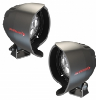
Part Number 0551753 12-24V LED Work Light with Spot Pattern & Side View Mirror Mount - 2 Light Kit