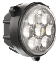
Part Number 0555341 12-24V LED Work Light with Spot Pattern & Panel Mount