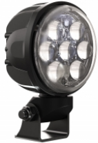
Part Number 0551001 12-24V LED Work Light with Spot Pattern