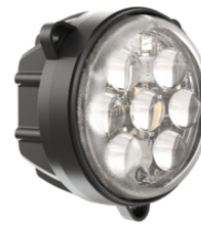
Part Number 0555461 12-24V LED Work Light with Flood Pattern & Panel Mount