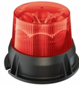
Part Number 0646561 12-80V LED Red Class I Strobe Light