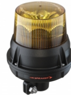
Part Number 0646741 12-80V LED Amber Class I Strobe Light with DIN Pole Mount