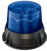
Part Number 0646551 12-80V LED Blue Class I Strobe Light