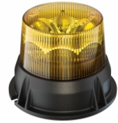
Part Number 0646891 12-80V LED Amber Class I Strobe Light with Magnet Mount