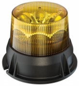
Part Number 0646491 12-80V LED Amber Class I Strobe Light