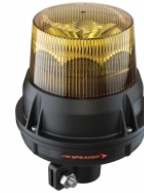
Part Number 0646741 12-80V LED Amber Class I Strobe Light with DIN Pole Mount