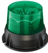
Part Number 0646571 12-80V LED Green Class I Strobe Light