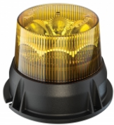
Part Number 0646491 12-80V LED Amber Class I Strobe Light