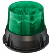
Part Number 0646571 12-80V LED Green Class I Strobe Light