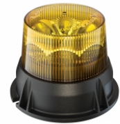
Part Number 0646891 12-80V LED Amber Class I Strobe Light with Magnet Mount