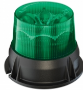
Part Number 0646571 12-80V LED Green Class I Strobe Light