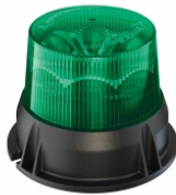
Part Number 0646571 12-80V LED Green Class I Strobe Light