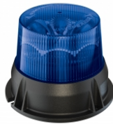
Part Number 0646551 12-80V LED Blue Class I Strobe Light