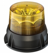
Part Number 0646881 12-80V LED Amber Class II Strobe Light with Magnet Mount & Adapter