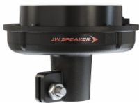
Part Number 8200213 DIN Pole Mount for 406 & 407 LED Strobe Lights