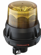
Part Number 0646731 12-80V LED Amber Class II Strobe Light with DIN Pole Mount