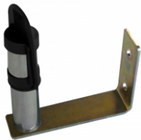
Part Number 0728311 Pipe Mount with L Bracket for DIN Pole Mount