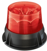
Part Number 0646541 12-80V LED Red Class II Strobe Light