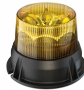
Part Number 0646881 12-80V LED Amber Class II Strobe Light with Magnet Mount & Adapter