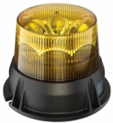
Part Number 0646501 12-80V LED Amber Class II Strobe Light