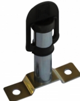
Part Number 0728321 Pipe Mount with Straight Bracket for DIN Pole Mount