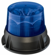
Part Number 0646531 12-80V LED Blue Class II Strobe Light