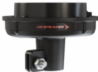
Part Number 8200213 DIN Pole Mount for 406 & 407 LED Strobe Lights