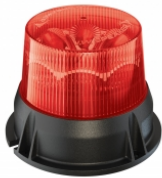
Part Number 0646541 12-80V LED Red Class II Strobe Light