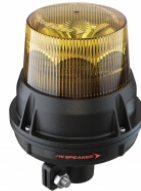
Part Number 0646731 12-80V LED Amber Class II Strobe Light with DIN Pole Mount