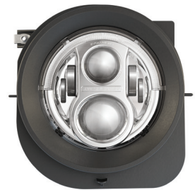
Right Side Chrome