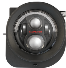
Left Side Black