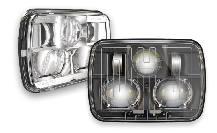
Shown Left: Model 8900 Evolution 2. Right: Model 8910 Evolution 2 with SmartHeat Lens

Designed for plug & play installation and compatible with DRL systems, the Model 8900 Evolution 2 is the ideal headlight for commercial vehicles where visibility is critical to ensuring productivity. The 8910 Evolution 2 features SmartHeat™ technology, with a heated lens to de-ice during extreme cold and ensure safe operation all year long. Whether used for delivery, mining, logging, waste disposal or over-the-road driving, these headlights deliver superior visibility, extreme durability and unparalleled longevity.