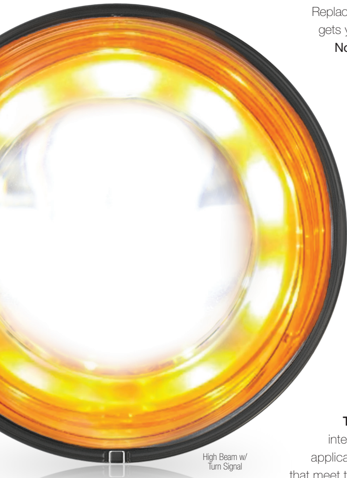
High Beam w/ Turn Signal

The Best Protection. Our re-designed die cast aluminum housing features a sealed integrated connector to meet the harsh demands of transportation and municipal applications. Dust and water ingress protection with a sealed vent cap and housing design that meet the tough criteria for IP67 and IP69K.