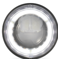
Daytime Running Light (DRL)