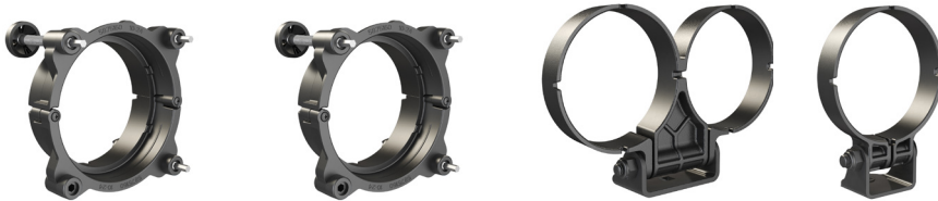
3-point Mount 1.5mm