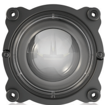
5-in-1 Headlight w/ 3-point Mount