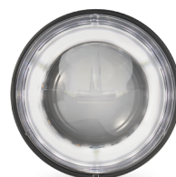
Front Position (FP)