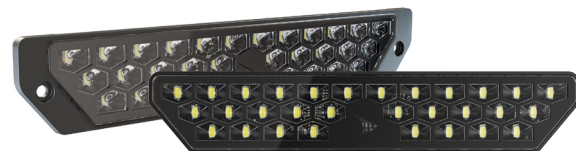
Backup & Work Light, Horizontal Flood Beam Post Mount