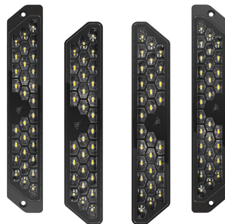
Work Light, Vertical Flood Beam Flange or Post Mount