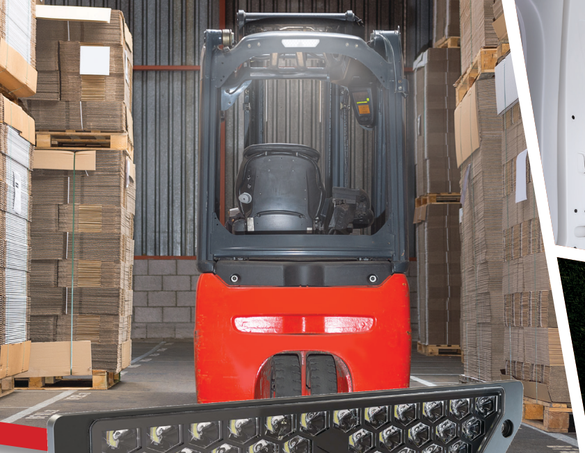
Work Light, Horizontal Flood Beam Flange or Post Mount