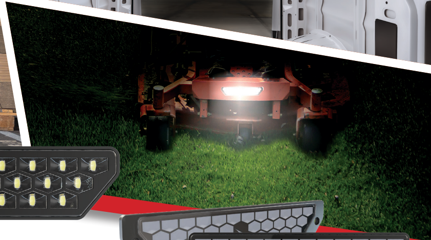
Work Light, Horizontal/Vertical Scene Beam Flange or Post Mount