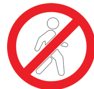
LED Pedestrian Warning Projector Light