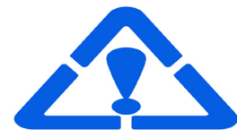
LED Universal Warning Blue Projector Light