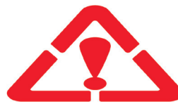
LED Universal Warning Red Projector Light