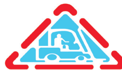
LED Warning Projector Light

With superior intensity and light quality, the innovative Model 560 LED Warning Projection Light plays an essential role in protecting operators and pedestrians from the potential dangers of moving machinery. As a result, occupational safety plus operator comfort and convenience are significantly improved, preventing workplace accidents.