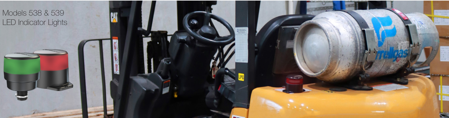
Models 538 & 539 LED Indicator Lights