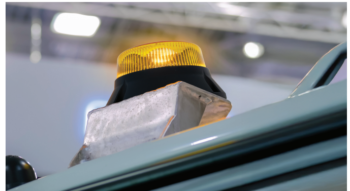
Model 407 Slim 5" Round Strobe LED Lights