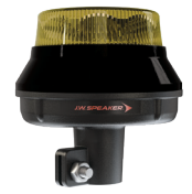
Model 407 with DIN Pole Mount