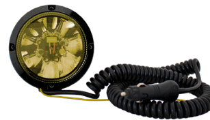
Model 407 with Magnet Mount