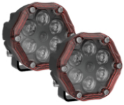
Part Number 0555363 12V LED Safety & Warning Light