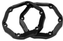
Part Number 8200543 Appearance Kit - RED