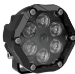
TRAIL 6 SPORT

Round LED Off Road Warning Light - Model Trail 6 Flash