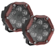
Part Number 0555363 12V LED Safety & Warning Light