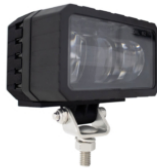
Part Number 0530303 24V LED Fog Light - 2 Light Kit with Mount & Wire Harness