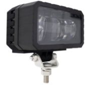
Part Number 0530993 12V LED High Beam & Front Position - 2 Light Kit with Mount & Wire Harness