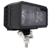
Part Number 0530993 12V LED High Beam & Front Position - 2 Light Kit with Mount & Wire Harness