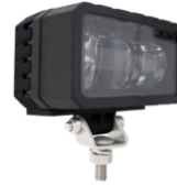
Part Number 0530313 24V LED High Beam & Front Position - 2 Light Kit with Mount & Wire Harness