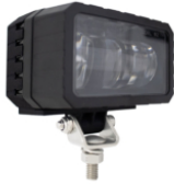
Part Number 0530293 12V LED Fog Light - 2 Light Kit with Mount & Wire Harness