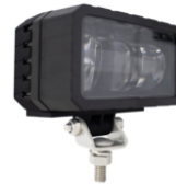
Part Number 0530313 24V LED High Beam & Front Position - 2 Light Kit with Mount & Wire Harness