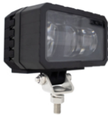
Part Number 0530293 12V LED Fog Light - 2 Light Kit with Mount & Wire Harness