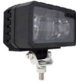
Part Number 0530303 24V LED Fog Light - 2 Light Kit with Mount & Wire Harness