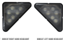
BOBCAT RIGHT HAND HEADLIGHT BOBCAT LEFT HAND HEADLIGHT

Part Number 1000041 12/24V Bobcat Left- Hand LED Headlight