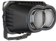
Part Number 1300801 12-72V LED Pedestrian Warning Projector Light