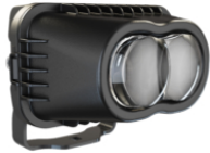
Part Number 1300661 12-72V LED Universal Warning Red Projector Light