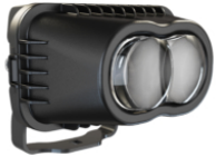
Part Number 1300631 12-72V LED Warning Projector Light