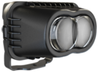
Part Number 1300631 12-72V LED Warning Projector Light