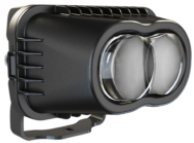
Part Number 1300631 12-72V LED Warning Projector Light