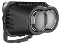
Part Number 1300661 12-72V LED Universal Warning Red Projector Light