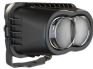
Part Number 1300801 12-72V LED Pedestrian Warning Projector Light