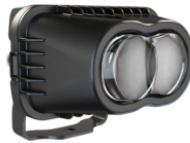
Part Number 1300801 12-72V LED Pedestrian Warning Projector Light