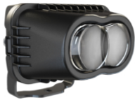
Part Number 1300631 12-72V LED Warning Projector Light