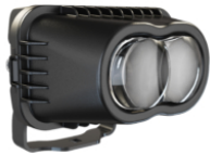
Part Number 1300791 12-72V LED Universal Warning Blue Projector Light