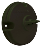
Part Number 0556142 12-24V 117mm Cyan Blackout Driving Light with Green Housing - Bulk Qty (24 MIN)