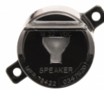
Part Number 0347522 24V Rear Blackout Stop Light - Bulk Qty (18 MIN)