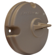
Part Number 0556132 12-24V 117mm Cyan Blackout Driving Light with Tan Housing - Bulk Qty (24 MIN)