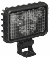
Part Number 1603241 12-24V LED Work Light with Spot Beam Pattern