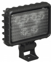
Part Number 1603251 12-24V LED Work Light with Trapezoid Beam Pattern