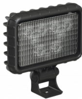
Part Number 1603311 12-24V LED Work Light with Spot Beam Pattern & On/Off Switch