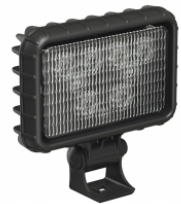
Part Number 1603331 12-24V LED Work Light with Flood Beam Pattern & On/Off Switch