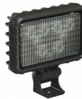
Part Number 1603321 12-24V LED Work Light with Trapezoid Beam Pattern & On/Off Switch