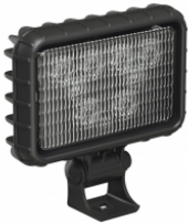
Part Number 1603251 12-24V LED Work Light with Trapezoid Beam Pattern