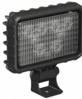
Part Number 1603261 12-24V LED Work Light with Flood Beam Pattern