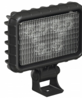
Part Number 1603311 12-24V LED Work Light with Spot Beam Pattern & On/Off Switch