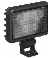
Part Number 1603321 12-24V LED Work Light with Trapezoid Beam Pattern & On/Off Switch