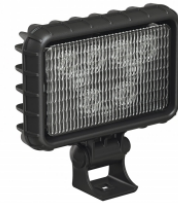
Part Number 1603331 12-24V LED Work Light with Flood Beam Pattern & On/Off Switch