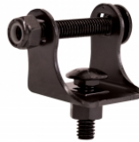
Part Number 8200121 Black Mount Kit for XD Series Work Lights