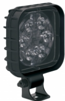
Part Number 1300101 12-110V LED Work Light with Spot Beam Pattern