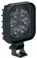
Part Number 1300001 12-24V LED Work Light with Flood Beam Pattern