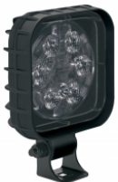
Part Number 1300091 12-110V LED Work Light with Flood Beam Pattern