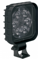
Part Number 1300041 12-110V LED Work Light with Trapezoid Beam Pattern & Integrated AMP Connector