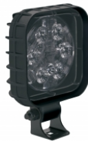
Part Number 1300021 12-24V LED Work Light with Spot Beam Pattern