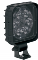
Part Number 1300031 12-110V LED Work Light with Trapezoid Beam Pattern & Integrated 2-Pin Deutsch Connector