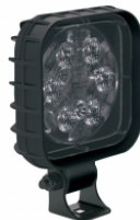
Part Number 1300301 12-48V LED Work Light with Left Hand Vertical Flood Beam Pattern