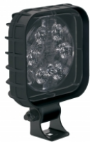
Part Number 1300011 12-24V LED Work Light with Trapezoid Beam Pattern