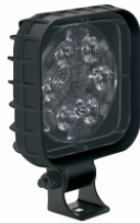
Part Number 1300101 12-110V LED Work Light with Spot Beam Pattern