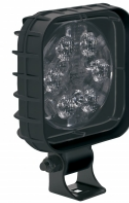
Part Number 1300031 12-110V LED Work Light with Trapezoid Beam Pattern & Integrated 2-Pin Deutsch Connector