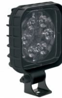
Part Number 1300041 12-110V LED Work Light with Trapezoid Beam Pattern & Integrated AMP Connector