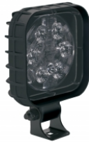
Part Number 1300011 12-24V LED Work Light with Trapezoid Beam Pattern