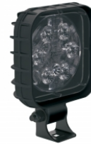
Part Number 1300031 12-110V LED Work Light with Trapezoid Beam Pattern & Integrated 2-Pin Deutsch Connector