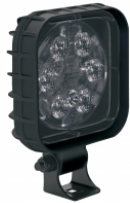
Part Number 1300011 12-24V LED Work Light with Trapezoid Pattern