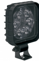
Part Number 1300041 12-110V LED Work Light with Trapezoid Beam Pattern & Integrated AMP Connector