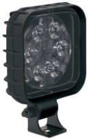
Part Number 1300001 12-24V LED Work Light with Flood Beam Pattern