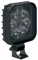
Part Number 1300091 12-110V LED Work Light with Flood Beam Pattern