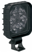
Part Number 1300301 12-48V LED Work Light with Left Hand Vertical Flood Beam Pattern