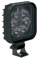
Part Number 1300101 12-110V LED Work Light with Spot Beam Pattern