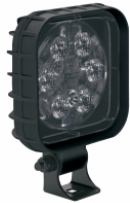
Part Number 1300011 12-24V LED Work Light with Trapezoid Beam Pattern