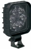
Part Number 1300021 12-24V LED Work Light with Spot Beam Pattern