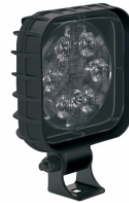
Part Number 1300041 12-110V LED Work Light with Trapezoid Beam Pattern & Integrated AMP Connector