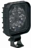
Part Number 1300301 12-48V LED Work Light with Left Hand Vertical Flood Beam Pattern