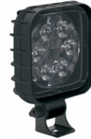
Part Number 1300041 12-110V LED Work Light with Trapezoid Beam Pattern & Integrated AMP Connector