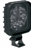
Part Number 1300091 12-110V LED Work Light with Flood Beam Pattern