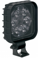
Part Number 1300021 12-24V LED Work Light with Spot Beam Pattern