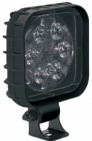
Part Number 1300101 12-110V LED Work Light with Spot Beam Pattern