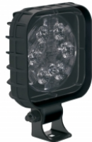
Part Number 1300311 12-48V LED Work Light with Right Hand Vertical Flood Beam Pattern