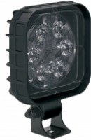
Part Number 1300031 12-110V LED Work Light with Trapezoid Beam Pattern & Integrated 2-Pin Deutsch Connector