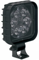
Part Number 1300011 12-24V LED Work Light with Trapezoid Beam Pattern