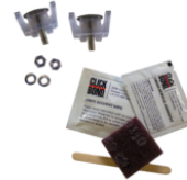
Part Number 8200491 Mounting Kit For Work Lights