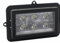
Part Number 0547431 12V LED Work Light with Flood Beam Pattern & Combine Retrofit Mount