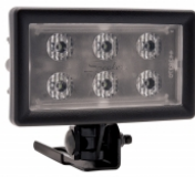
Part Number 0545971 12V LED Work Light with Flood Beam Pattern & Bottom Mount