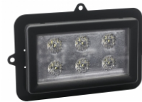
Part Number 0547431 12V LED Work Light with Flood Beam Pattern & Combine Retrofit Mount