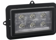
Part Number 0547431 12V LED Work Light with Flood Beam Pattern & Combine Retrofit Mount