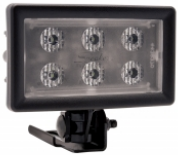
Part Number 0545971 12V LED Work Light with Flood Beam Pattern & Bottom Mount