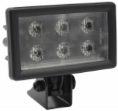
Part Number 0545961 12V LED Work Light with Flood Beam Pattern & Fender Mount