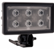
Part Number 0545971 12V LED Work Light with Flood Beam Pattern & Bottom Mount