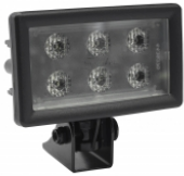
Part Number 0545961 12V LED Work Light with Flood Beam Pattern & Fender Mount