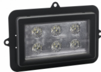
Part Number 0547431 12V LED Work Light with Flood Beam Pattern & Combine Retrofit Mount