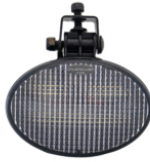
Part Number 1707321 12V LED CNH Work Light - Direct Replacement for 87001315 & 87284332