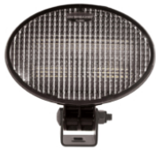
Part Number 1707301 12V LED Work Light with Flood Beam Pattern with Pedestal Mount