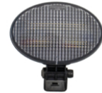
Part Number 1707351 12V LED John Deere Work Light - Direct Replacement for RE198622 & RE198623