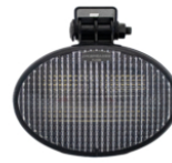
Part Number 1707341 12V LED CNH Work Light - Direct Replacement for 84520928 & 84564892