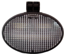
Part Number 1707311 12V LED Work Light with Flood Beam Pattern with Pendant Mount