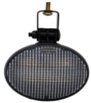
Part Number 1707361 12V LED John Deere Work Light - Direct Replacement for AXE16947, AH207789 & AXE40244