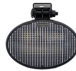
Part Number 1707341 12V LED CNH Work Light - Direct Replacement for 84520928 & 84564892