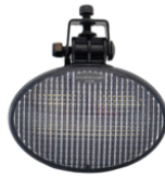
Part Number 1707321 12V LED CNH Work Light - Direct Replacement for 87001315 & 87284332