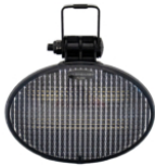
Part Number 1707371 12V LED John Deere Work Light - Direct Replacement for AXE45388 & AXE43722