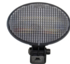
Part Number 1707351 12V LED John Deere Work Light - Direct Replacement for RE198622 & RE198623