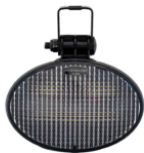
Part Number 1707371 12V LED John Deere Work Light - Direct Replacement for AXE45388 & AXE43722