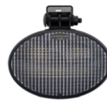
Part Number 1707341 12V LED CNH Work Light - Direct Replacement for 84520928 & 84564892