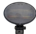
Part Number 1707351 12V LED John Deere Work Light - Direct Replacement for RE198622 & RE198623