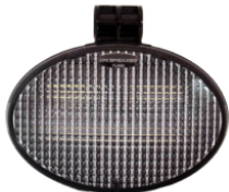
Part Number 1707311 12V LED Work Light with Flood Beam Pattern with Pendant Mount