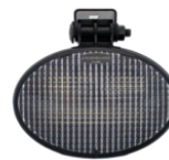
Part Number 1707341 12V LED CNH Work Light - Direct Replacement for 84520928 & 84564892