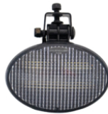
Part Number 1707321 12V LED CNH Work Light - Direct Replacement for 87001315 & 87284332