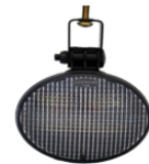
Part Number 1707361 12V LED John Deere Work Light - Direct Replacement for AXE16947, AH207789 & AXE40244