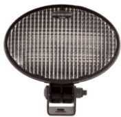
Part Number 1707301 12V LED Work Light with Flood Beam Pattern with Pedestal Mount