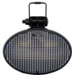
Part Number 1707371 12V LED John Deere Work Light - Direct Replacement for AXE45388 & AXE43722