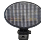
Part Number 1707351 12V LED John Deere Work Light - Direct Replacement for RE198622 & RE198623