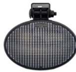
Part Number 1707341 12V LED CNH Work Light - Direct Replacement for 84520928 & 84564892