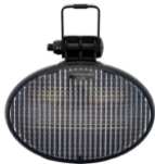
Part Number 1707371 12V LED John Deere Work Light - Direct Replacement for AXE45388 & AXE43722