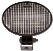
Part Number 1707301 12V LED Work Light with Flood Beam Pattern with Pedestal Mount