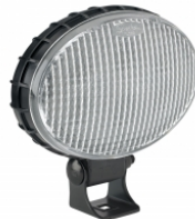
Part Number 1706241 12-48V LED Work Light with Flood Beam Pattern & DT04-2P Connector