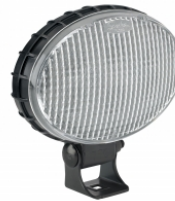
Part Number 1706251 12-48V LED Work Light with Trapezoid Beam Pattern & DT04-2P Connector