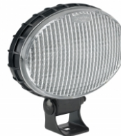
Part Number 1706251 12-48V LED Work Light with Trapezoid Beam Pattern & DT04-2P Connector