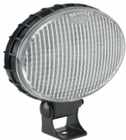
Part Number 1706041 12V LED Work Light with Flood Beam Pattern & DT04-2P Connector