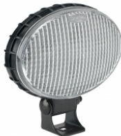
Part Number 1706051 12V LED Work Light with Trapezoid Beam Pattern & DT04-2P Connector