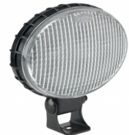
Part Number 1706461 12-48V LED Work Light with Flood Beam Pattern & PE12015792 Connector