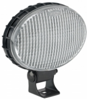
Part Number 1706041 12V LED Work Light with Flood Beam Pattern & DT04-2P Connector