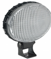
Part Number 1706251 12-48V LED Work Light with Trapezoid Beam Pattern & DT04-2P Connector