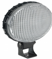
Part Number 1706251 12-48V LED Work Light with Trapezoid Beam Pattern & DT04-2P Connector