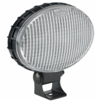
Part Number 1706461 12-48V LED Work Light with Flood Beam Pattern & PE12015792 Connector