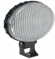
Part Number 1706461 12-48V LED Work Light with Flood Beam Pattern & PE12015792 Connector