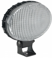
Part Number 1706241 12-48V LED Work Light with Flood Beam Pattern & DT04-2P Connector