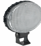
Part Number 1706461 12-48V LED Work Light with Flood Beam Pattern & PE12015792 Connector