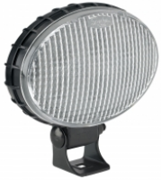
Part Number 1706041 12V LED Work Light with Flood Beam Pattern & DT04-2P Connector