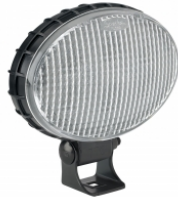
Part Number 1706251 12-48V LED Work Light with Trapezoid Beam Pattern & DT04-2P Connector