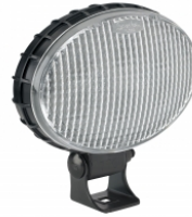
Part Number 1706261 12-48V LED Work Light with Spot Beam Pattern & DT04-2P Connector