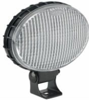
Part Number 1706241 12-48V LED Work Light with Flood Beam Pattern & DT04-2P Connector