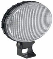
Part Number 1706041 12V LED Work Light with Flood Beam Pattern & DT04-2P Connector