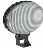
Part Number 1706261 12-48V LED Work Light with Spot Beam Pattern & DT04-2P Connector