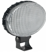
Part Number 1706251 12-48V LED Work Light with Trapezoid Beam Pattern & DT04-2P Connector