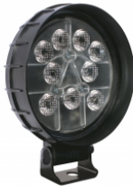
Part Number 1501651 12-24V LED Work Light with Trapezoid Beam Pattern