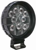
Part Number 1501641 12-24V LED Work Light with Flood Beam Pattern