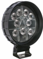
Part Number 1501661 12-24V LED Work Light with Spot Beam Pattern