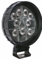
Part Number 1501661 12-24V LED Work Light with Spot Beam Pattern