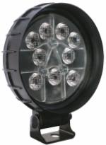
Part Number 1501641 12-24V LED Work Light with Flood Beam Pattern