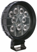
Part Number 1501651 12-24V LED Work Light with Trapezoid Beam Pattern