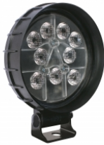
Part Number 1501661 12-24V LED Work Light with Spot Beam Pattern