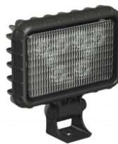
5" x 3" LED Work Lights