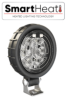
4.5" Round Heated & Non-Heated Work Lights

LED Heated and Non-Heated Work Lights - Model 670 XD