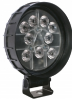
5.75" Round LED Work Lights

LED Heated and Non-Heated Work Lights - Model 670 XD