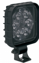
4" x 4" LED Work Lamps

LED Work Light & Turn Signal - Model 775 XD