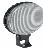
5" x 3" Oval LED Work Lights