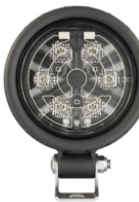
Part Number 1403471

12-110V LED Work Light with Flood Beam Pattern