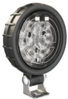
Part Number 1403291

12-110V LED Work Light with Spot Beam Pattern