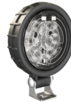
Part Number 1403271

12-24V LED Work Light with Spot Beam Pattern