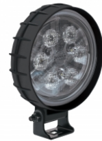
Part Number 1403281 12-110V LED Work Light with Spot Beam Pattern