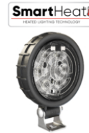
Part Number 1403271 12-110V LED Work Light with Trapezoid Beam Pattern