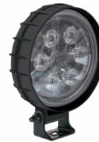
Part Number 1403281 12-110V LED Work Light with Spot Beam Pattern