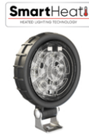
Part Number 1403261 12-24V LED Work Light with Spot Beam Pattern