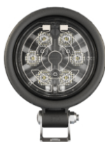
Part Number 1403481 12-24V LED Heated Work Light with Spot Beam Pattern