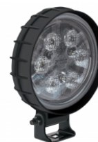
Part Number 1403291 12-110V LED Work Light with Flood Beam Pattern