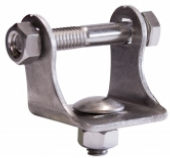
Part Number 8200101 Stainless Steel Mounting Kit for Work Lights & Marine Lights