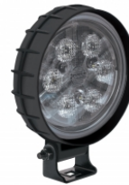
Part Number 1403271 12-110V LED Work Light with Trapezoid Beam Pattern