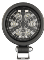
Part Number 1403481 12-24V LED Heated Work Light with Spot Beam Pattern