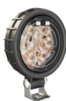
Part Number 1403491 12-24V LED Heated Amber Work Light with Flood Beam Pattern