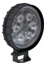
Part Number 1403241 12-24V LED Work Light with Flood Beam Pattern