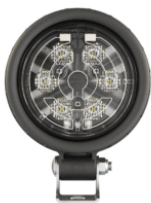
Part Number 1403471 12-24V LED Heated Work Light with Flood Beam Pattern