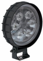
Part Number 1403241 12-24V LED Work Light with Flood Beam Pattern