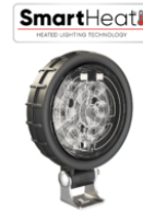
Part Number 1403271 12-110V LED Work Light with Trapezoid Beam Pattern