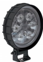
Part Number 1403251 12-24V LED Work Light with Trapezoid Beam Pattern