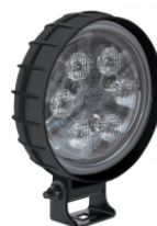
Part Number 1403271 12-110V LED Work Light with Trapezoid Beam Pattern