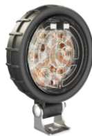
Part Number 1403491 12-24V LED Heated Amber Work Light with Flood Beam Pattern