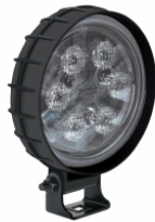
Part Number 1403251 12-24V LED Work Light with Trapezoid Beam Pattern