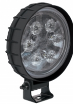
Part Number 1403261 12-24V LED Work Light with Spot Beam Pattern