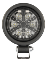
Part Number 1403471 12-24V LED Heated Work Light with Flood Beam Pattern