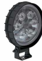
Part Number 1403271 12-110V LED Work Light with Trapezoid Beam Pattern