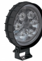
Part Number 1403291 12-110V LED Work Light with Flood Beam Pattern