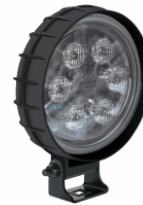
Part Number 1403291 12-110V LED Work Light with Flood Beam Pattern