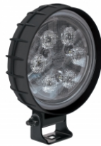
Part Number 1403261 12-24V LED Work Light with Spot Beam Pattern