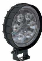
Part Number 1403261 12-24V LED Work Light with Spot Beam Pattern