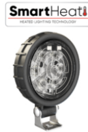
Part Number 1403251 12-24V LED Work Light with Trapezoid Beam Pattern