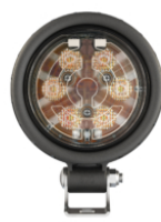
Part Number 1403491 12-24V LED Heated Amber Work Light with Flood Beam Pattern