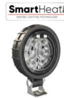
Part Number 1403291 12-110V LED Work Light with Flood Beam Pattern