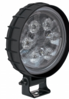
Part Number 1403271 12-110V LED Work Light with Trapezoid Beam Pattern