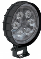
Part Number 1403251 12-24V LED Work Light with Trapezoid Beam Pattern