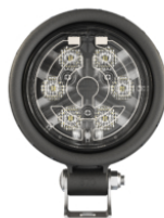
Part Number 1403481 12-24V LED Heated Work Light with Spot Beam Pattern