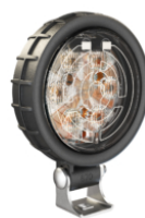
Part Number 1403491 12-24V LED Heated Amber Work Light with Flood Beam Pattern