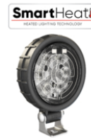
Part Number 1403281 12-110V LED Work Light with Spot Beam Pattern