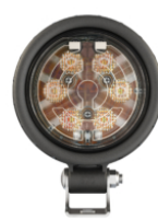
Part Number 1403491 12-24V LED Heated Amber Work Light with Flood Beam Pattern