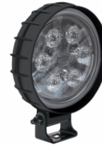
Part Number 1403281 12-110V LED Work Light with Spot Beam Pattern