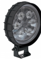
Part Number 1403281 12-110V LED Work Light with Spot Beam Pattern