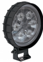
Part Number 1403271 12-110V LED Work Light with Trapezoid Beam Pattern