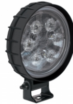
Part Number 1403271 12-110V LED Work Light with Trapezoid Beam Pattern