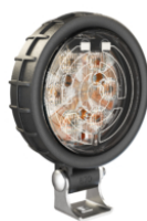
Part Number 1403491 12-24V LED Heated Amber Work Light with Flood Beam Pattern