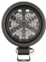
Part Number 1403471 12-24V LED Heated Work Light with Flood Beam Pattern