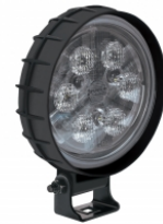
Part Number 1403291 12-110V LED Work Light with Flood Beam Pattern