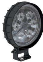
Part Number 1403251 12-24V LED Work Light with Trapezoid Beam Pattern