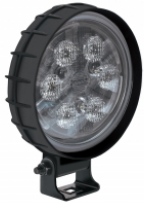
Part Number 1403241 12-24V LED Work Light with Flood Beam Pattern