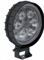
Part Number 1403291 12-110V LED Work Light with Flood Beam Pattern