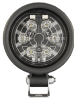
Part Number 1403481 12-24V LED Heated Work Light with Spot Beam Pattern