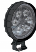
Part Number 1403281 12-110V LED Work Light with Spot Beam Pattern