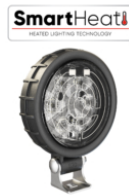
Part Number 1403271 12-110V LED Work Light with Trapezoid Beam Pattern