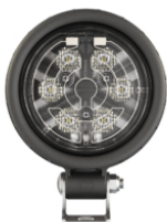
Part Number 1403471 12-24V LED Heated Work Light with Flood Beam Pattern