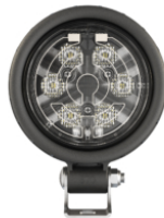
Part Number 1403481 12-24V LED Heated Work Light with Spot Beam Pattern