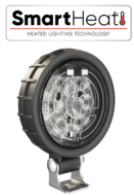
Part Number 1403241 12-24V LED Work Light with Flood Beam Pattern