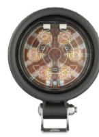
Part Number 1403491 12-24V LED Heated Amber Work Light with Flood Beam Pattern