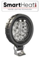
Part Number 1403241 12-24V LED Work Light with Flood Beam Pattern