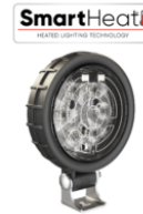
Part Number 1403281 12-110V LED Work Light with Spot Beam Pattern