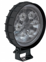
Part Number 1403291 12-110V LED Work Light with Flood Beam Pattern