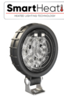
Part Number 1403271 12-110V LED Work Light with Trapezoid Beam Pattern