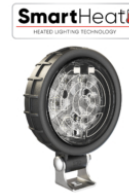
Part Number 1403291 12-110V LED Work Light with Flood Beam Pattern